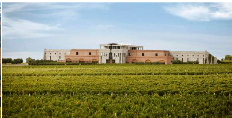
Left Photo: Bodega Diamandes